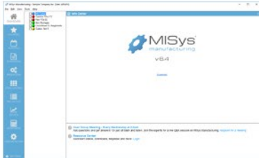
Dashboard Navigation and Alerts

Seamless integration with the most popular accounting software