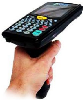
Hand held data collection

MISys has developed two different bar coding systems: MISys Manufacturing Bar Coding and the enhanced MISys Worth Terminal Manager. Both systems are available with the Bar Coding module from MISys, but each requires different hardware which is sold separately.